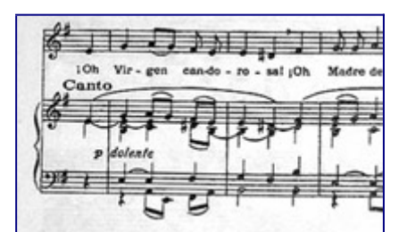
Click to see enlarged image and learn more about the <u>Virgen de los</u> <u>Dolores</u>.

View Lance Beeson's transcription of the <u>Virgen</u> <u>de los Dolores in pdf format</u>.