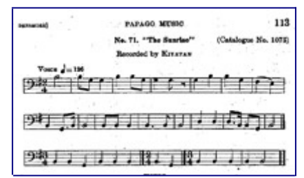
Click to see enlarged image and learn more about the Sunrise song .